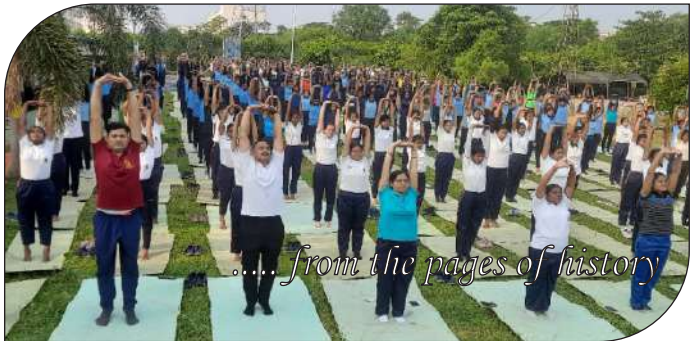
NCC Cadets (Girls) of Annual Training Camp # Nilachal Campus