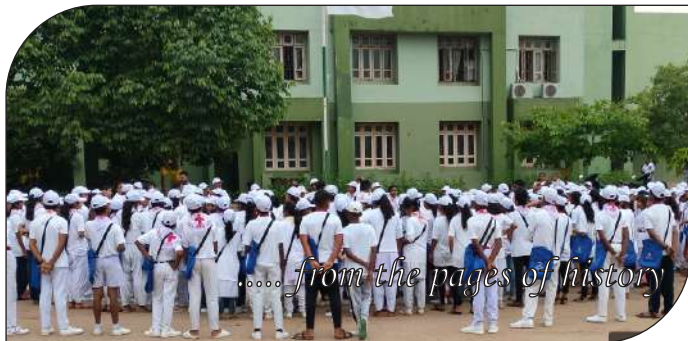
State Level Junior Red Cross Study-cum-Training Camp # Nilachal Campus