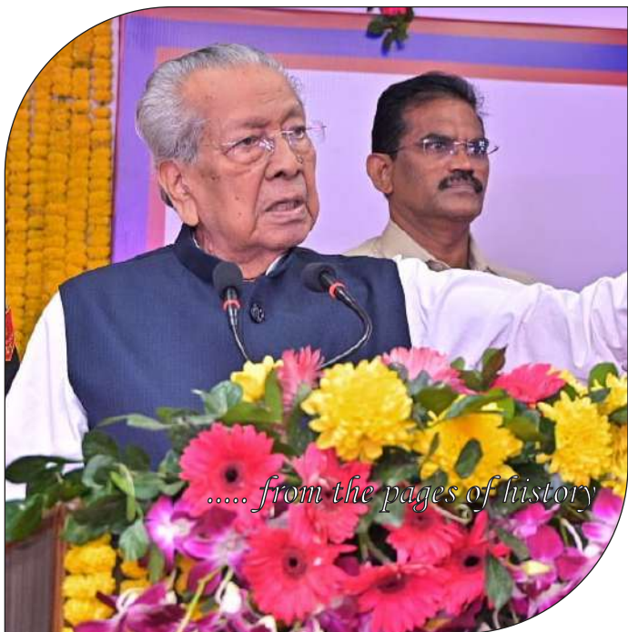
Hon'ble Governor of Andhra Pradesh, Biswa Bhusan Harichandan addressing the Audience