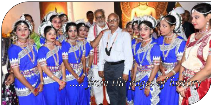
Cultural Programmes on eve of Silver Jubilee Celebration # 2022